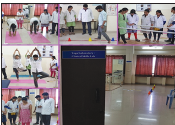
Yoga & Clinical Skill Lab