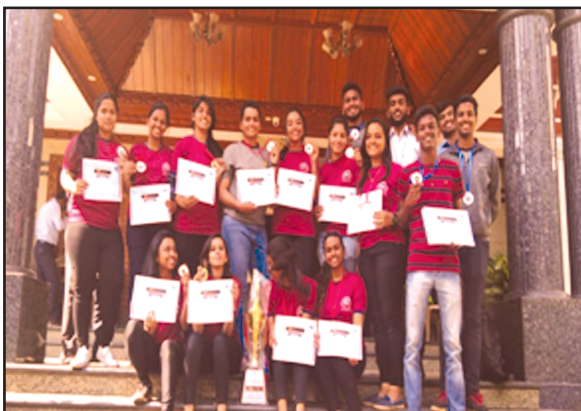
Intercollegiate Sports Competition