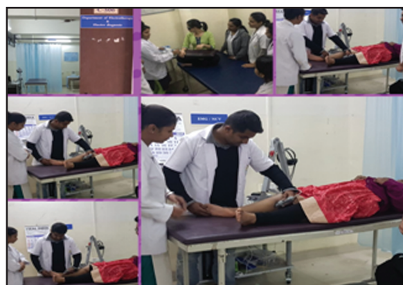
Electro Diagnosis Lab