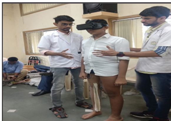
Post- Amputee Rehabilitation