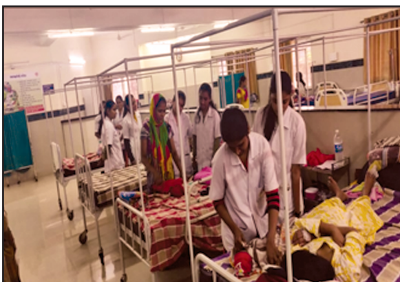
ANC – PNC Rehabilitation